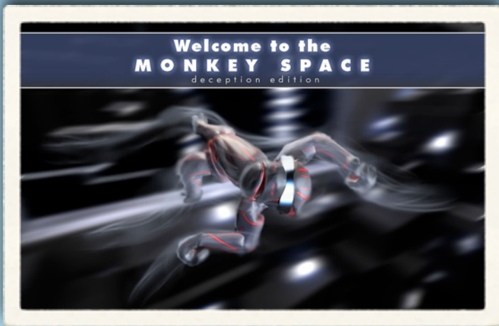
The Monkey Space: Game design, special effects and voice acting